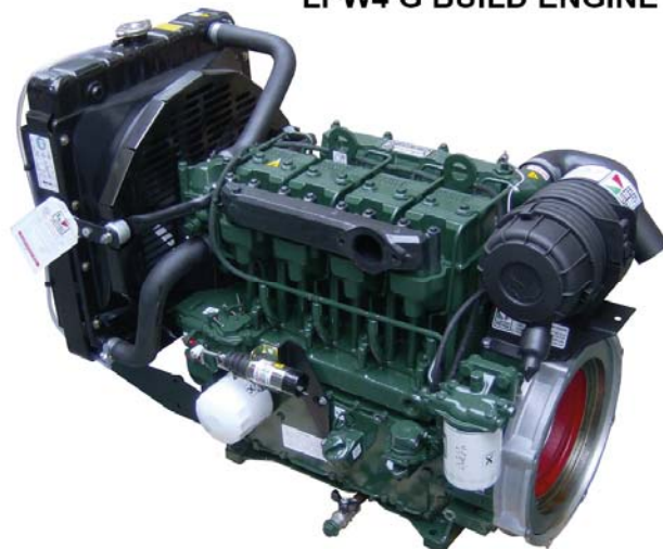
LPW4 G BUILD ENGINE